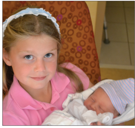
Pro-Family, Pro-Life Resources