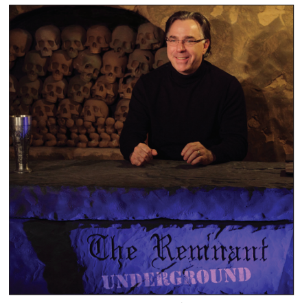
Remnant TV news and programming