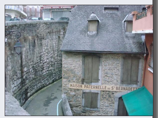
Visit the childhood home of St. Bernadette