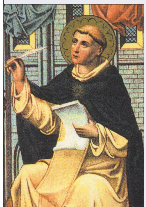
Learn more about St. Thomas Aquinas, visit the tomb of the Angelic Doctor