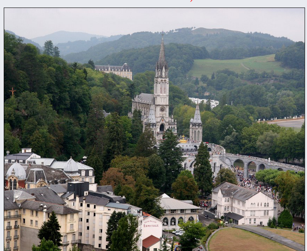
Lourdes, France: The Most Popular Marian Shrine in the World