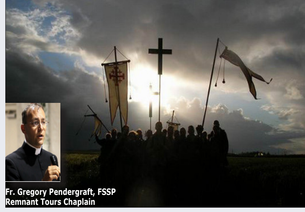
On Pentecost, join 15,000 Catholics who will be walking from Paris to Chartres on the 3-day, 70-mile medieval-style: