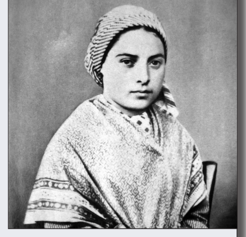
Visit the village of St. Bernadette Soubirous, the little girl who saw the Mother of God

Call us today for more info: 651-433-5425 www.RemnantNewspaper.com