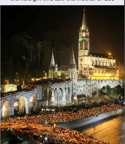
The most beautiful Marian shrine in the world Pray the rosary, bathe in the miraculous waters