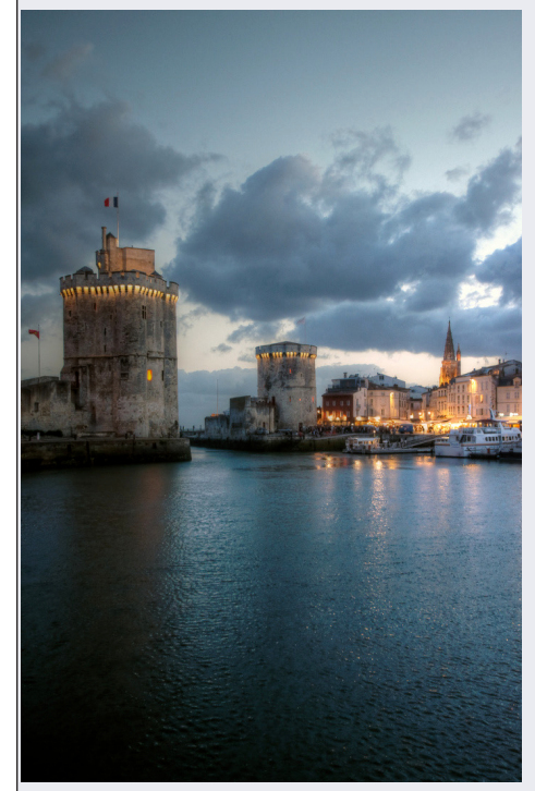
La Rochelle & the "wars of religion"

(The Remnant Tours' 23rd Pilgrimage to Chartres will include: Paris, Lourdes, La Rochelle, Toulouse, Nevers)