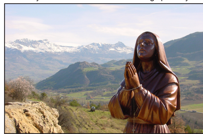
The Sanctuary of Notre-Dame du Laus