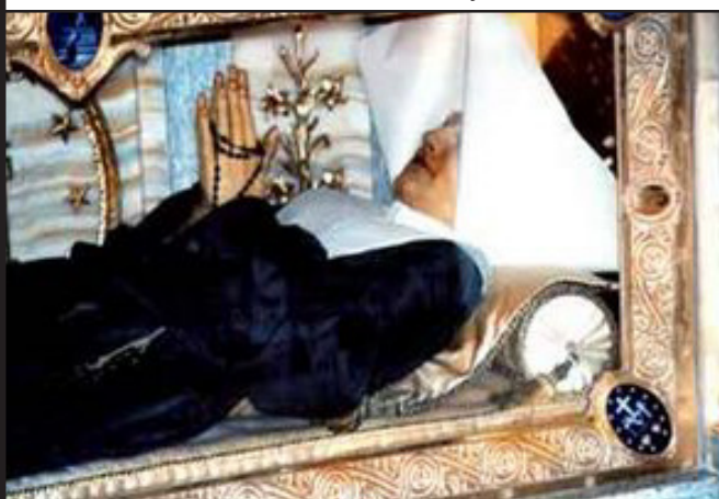
Rue du Bac (Incorrupt Body of St. Catherine)

Visit the home, church and incorrupt body of St. John Vianney